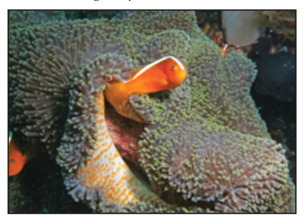
Happy Diving! SeaLife www.sealife-cameras.com

SeaLife guarantees the original purchaser of this product, for a period of one (1) year from the date of purchase, that the product is free from defects in workmanship and materials. For a detailed warranty statement, please refer to the warranty information included with the product. In the event the original purchaser believes there is a defect in a product, it is recommended that the purchaser first visit www.sealife-cameras.com for product updates and technical advice. The SeaLife website also includes detailed information on how to get repair service.